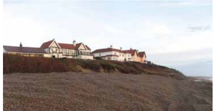
The exposed and eroded cliffs (below left) before and (above) after the first phase of work

"We agreed the first phase after talking with the local community, some of who were prepared to make it possible by putting in their own funds. Their realistic and pro-active approach, almost unique in the country as far as we know, has now been recognised as a prime example of