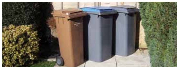
The three bin scheme has been key to your success

"Suffolk Coastal and our partners Suffolk Coastal Services provide an excellent waste collection service and I hope our residents are