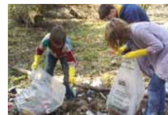
Young volunteers in action cleaning up

Many groups also kept separate any recyclable tins, plastic containers and newspapers found, helping divert much of the recyclable litter away from landfill.