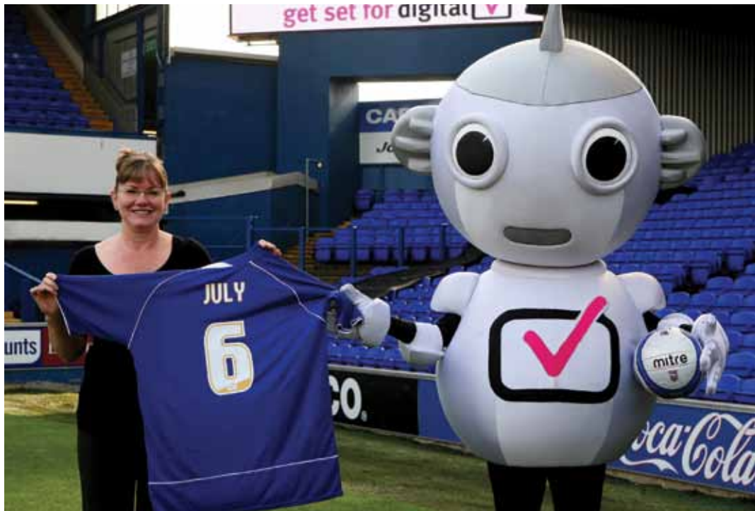
The digital tv switchover was recently promoted at Portman Road

team would remind residents that nearly any TV can be converted by the use of a digital box. However, if you are planning to upgrade your TV, please buy one that is energy efficient.