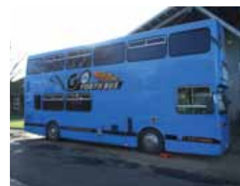
Going with the flow

The Suffolk Coastal Local Strategic Partnership supported Go with the Flow bus is continuing to make regular visits across some of the rural parts of our district offering somewhere for young people to enjoy.