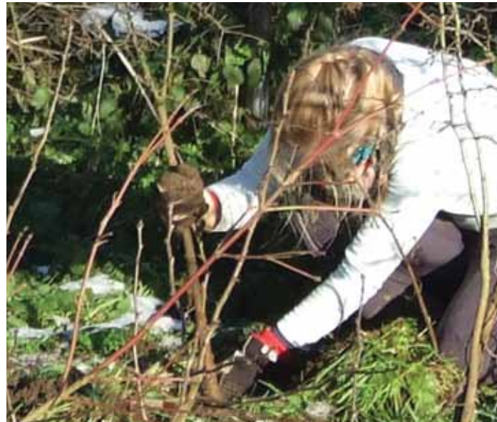
A Footprints volunteer plants another tree for the district

Although most of the winter work is now completed, during the spring and summer more work parties will be needed to help with hay meadow management, footpath clearing and wildlife surveys. Individual residents,