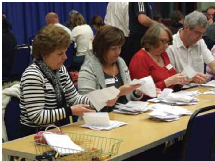
Thousands of votes are set to be counted after May 5

However, there will be all the information you could want