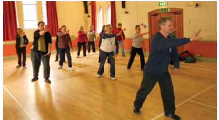
One of the Fit Village exercise classes

If 40 or more from a village express an interest, taster sessions and eight week courses could be set up for activities such as health walks, badminton, yoga,