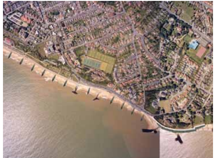
The Central Felixstowe area set to be defended

"To have lost this scheme, with the near certainty of collapse of parts of the sea wall, with imminent danger then of major losses to homes, businesses and infrastructure, as well as the serious impact on tourism and jobs, was unthinkable. The support of the Suffolk