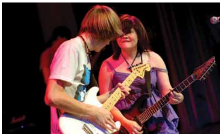
Deadbeat on stage at last year's Soundwaves heats

The battle for the title of the Soundwaves Ultimate Band 2011 is already underway with local young musicians and bands taking to the stage to display their talents.