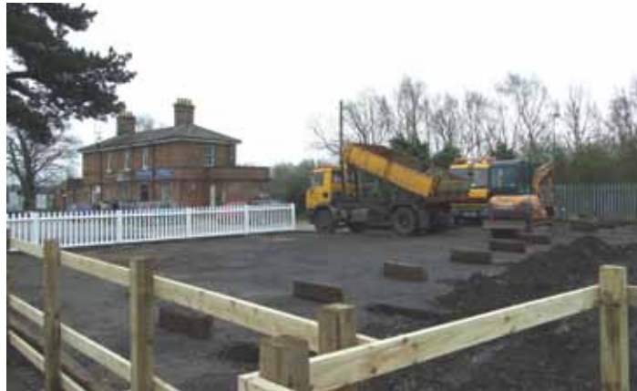
Work under way at Melton station

The work has been made possible thanks to Council