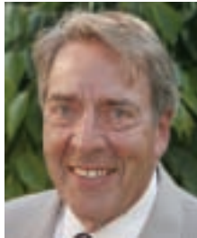
Framlingham Winter Rose (C) 01728 621659 winter.rose@