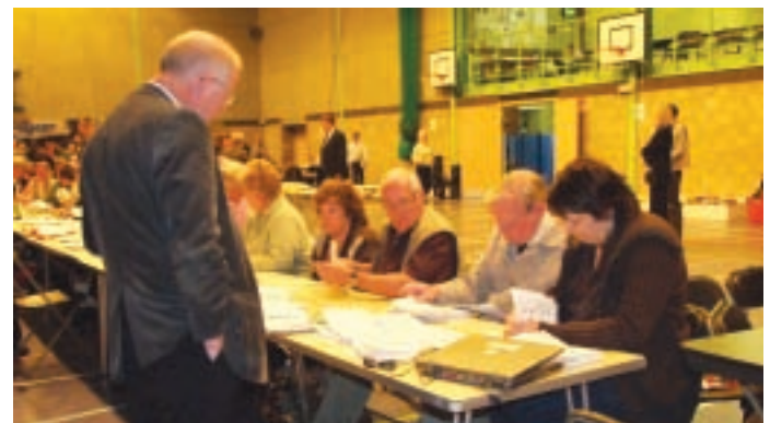
The count is under way at Brackenbury Sports Centre

A grand total of 127 candidates contested the 55 seats on Suffolk Coastal District Council in May, when the Conservative Party increased its majority.