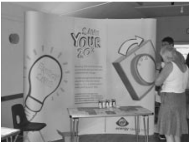
Middleton Energy Day