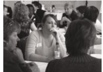
One of the workshops

Each district is required by the Government to have its own LSP working to enhance the local quality of life, and help co-ordinate and shape the future action of public, private, voluntary and community organisations.