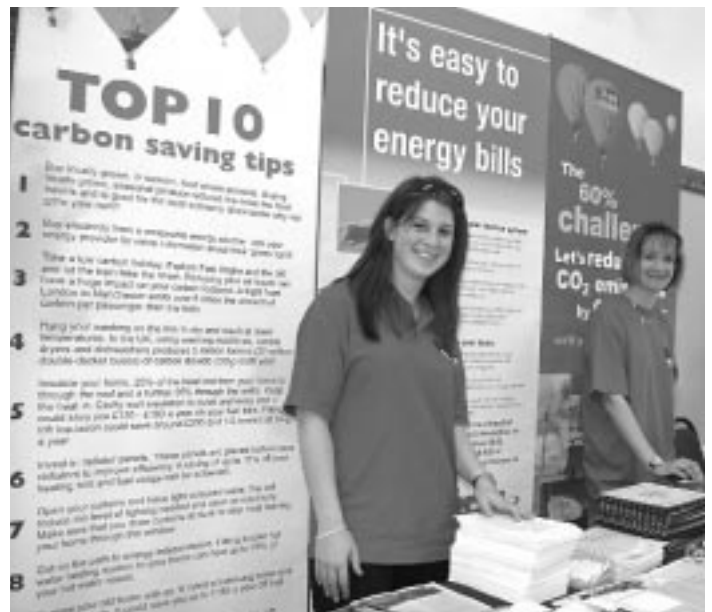
Wenhaston Energy Day

Individuals are also encouraged to join the CRed Community and make pledges on actions they can take personally to reduce their carbon footprint by going to the website www.cred-uk.org/suffolk