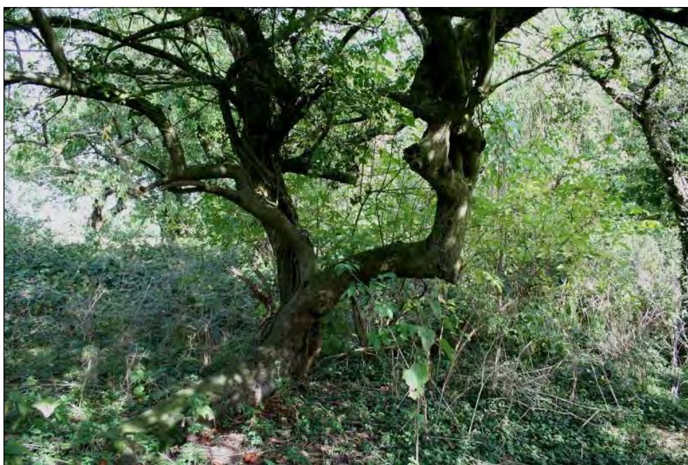
An 80 year old Crimson Bramley apple almost smothered by nettles and brambles.

By taking action today to record and conserve old orchards and their history, we can enrich our own lives in so many ways.