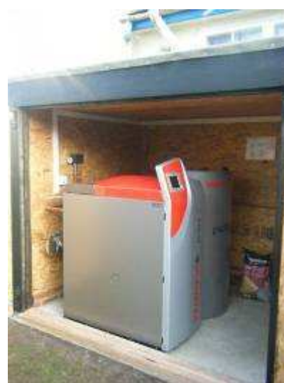
A 15kW biomass boiler installed at the Wardens Trust, Sizewell.