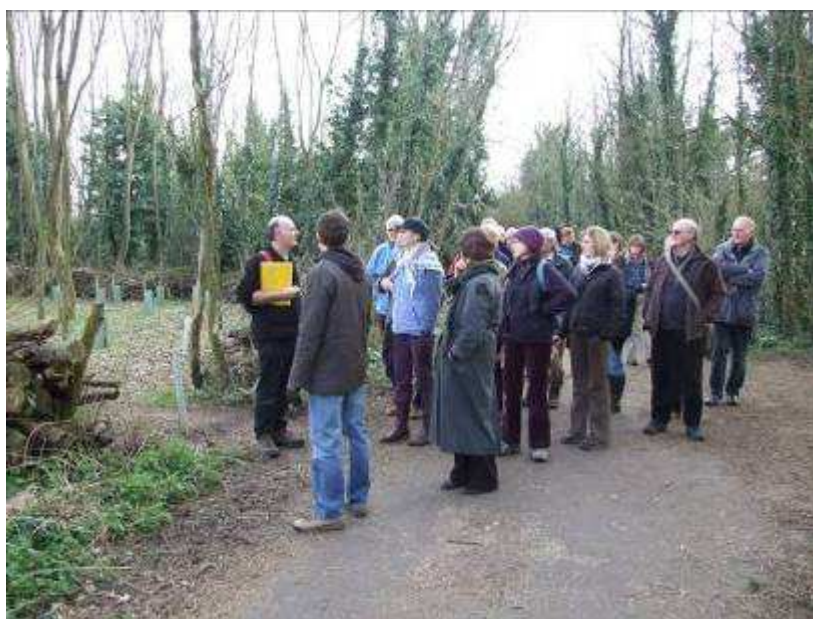
Walk through Portal woods following the Community Woodland event 20 March 2011

It has been made possible by the kind support of Suffolk Coastal Local Strategic Partnership, Suffolk Coast and Heaths AONB SDF Fund, The Environment Agency, the Suffolk Coastal Greenprint Forum, Suffolk Coastal District Council and Groundwork UK and Groundwork East of England. Many others have also provided their invaluable advice including the Suffolk Climate Change Partnership, Suffolk Acre and SAVO.