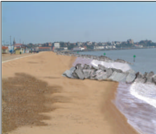
Figure 2: Photo sketch of planned works