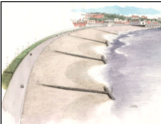
Figure 3: Artist's Impression of planned works

Figures 2 and 3 give an indication of the result of the works between the War Memorial and Landguard Common when they are finished.