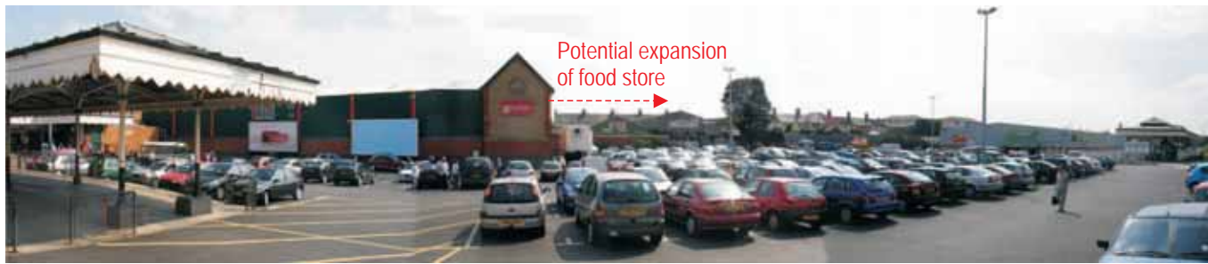
View south across existing food store car park - no landscaping, poor pedestrian access, no connection to rail service platform