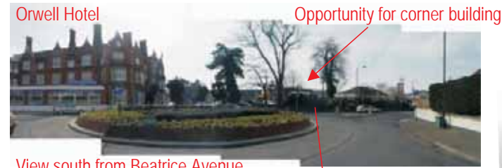
View south from Beatrice Avenue