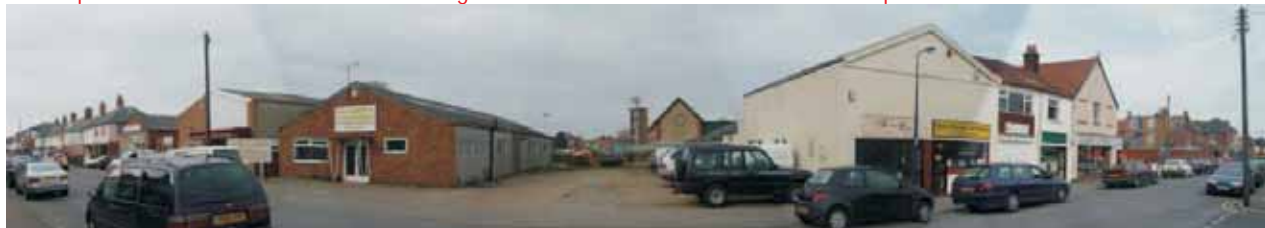
Potential to accommodate small business units with service access on site of existing shed units