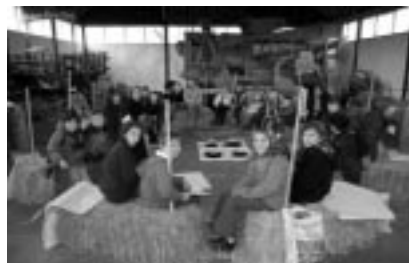
Children enjoying themselves down on the farm

The morning sessions are between 10am and 12 noon and are aimed at children aged 12 and under (an adult must accompany those under eight). The focus in the afternoon between 2pm and 4pm switches to young people aged 13