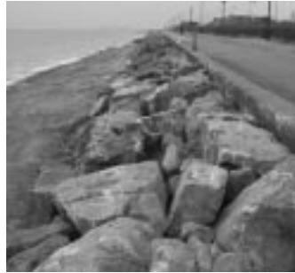
Sea defence works at Felixstowe

More emergency protection works, costing £300,000, to safeguard Felixstowe's sea wall and lessen the risk of flooding in the resort have been undertaken.